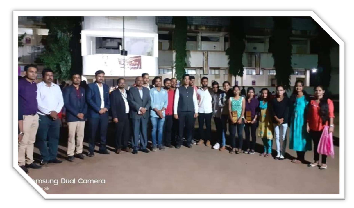
Figure 3 Staff and Alumni Students

The session was carried out in the form of informal interaction and followed by dinner. They promised one again that they will be in touch with the institute, faculty and students for the purpose of development of the students as well as the institute.